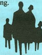
The Family Bank

speaker. Those with memorabilia related to FNB (old bankbooks, calendars, whatever) are invited to bring materials for display during the meeting.